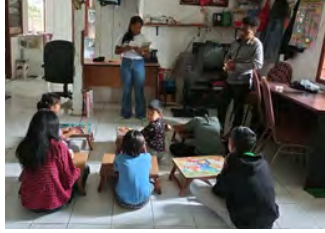
Kubik (age 13-18)