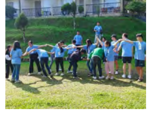
Youth ( 18 yeras old above)

In 2025, God has entrusted us with 214 children, 54 teenagers, and 43 young adults to disciple. He has also entrusted us with 5 children to mentor intensively from junior high school to university level through our Smart Kids program. With God's help, we are empowered to continue preparing these children to become impactful leaders in their communities