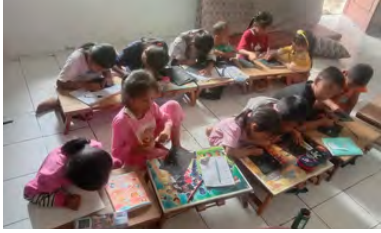
Katumbiri (Age 5-12 )